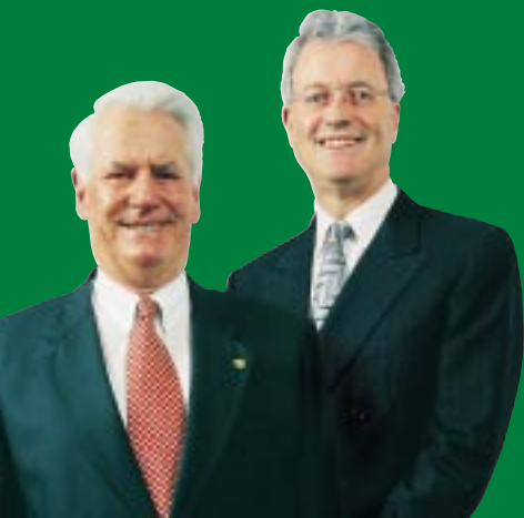
HARRY PERKINS CHAIRMAN WESFARMERS LIMITED

Formal expert reports will be included with the detailed documents to be mailed out to investors in March.