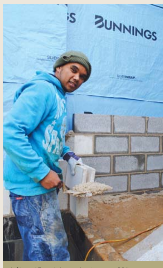
A Clontarf Foundation student learns to 'DIY' with Bunnings in Warrnambool.

Wesfarmers will continue to strengthen local relationships with Clontarf academies in 2012.