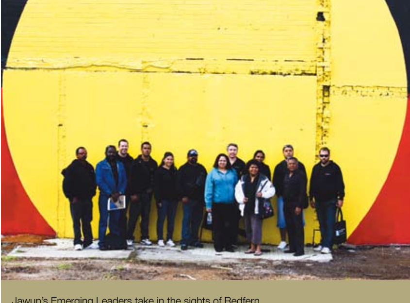
Jawun's Emerging Leaders take in the sights of Redfern.