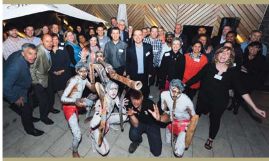
Wesfarmers team members and the Wurundjeri Tribe welcome Jawun's Emerging Leaders to Melbourne.

In 2011, Wesfarmers was proud to sponsor the inaugural Jawun Emerging Leaders tour. Recognising the wealth of experience and learnings in the four Jawun host communities (Cape York, the East Kimberley, Redfern and Shepparton) Jawun sought the support of Wesfarmers to conduct a tour of all four communities, attended by emerging Aboriginal leaders from those communities.